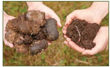
Raw manure and finished compost

All organic matter contains microbial organisms; these are the workers that break down manure, converting it into compost. The microbes have specific temperature, moisture and oxygen requirements. Managing your pile for these three variables will help you produce quality compost in a short amount of time.