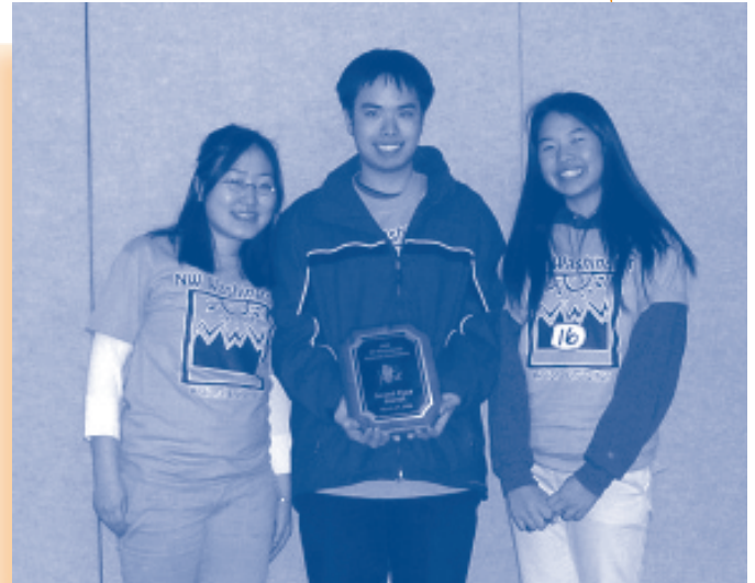
Pacific Science Center students win First Place in District and 2nd overall in the NW Regional Envirothon event.

The Envirothon is the largest Natural Resources Environmental Competition in North America. It is a problem solving competition for high school students, grades 9 through 12. Students are challenged to use critical thinking skills and conduct a hands-on investigation of environmental topics in five categories: Water, Soil, Forestry, Wildlife and a Current Environmental Issue. This year's theme is "Water Stewardship in a Changing Climate".