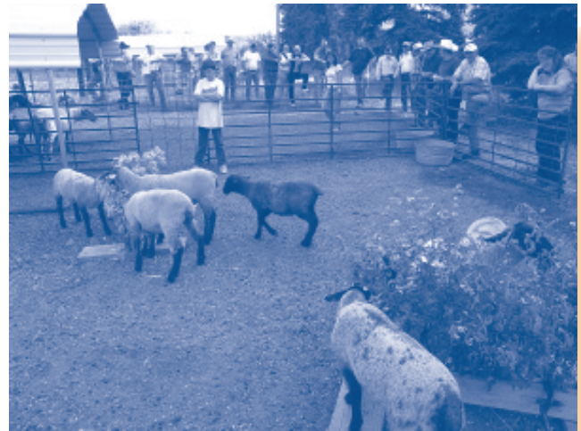
Teaching sheep to eat plants they normally would avoid.